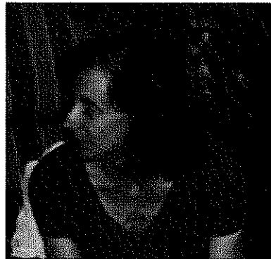
She's Baaack...and running as a write in candidate

This candidate was found "Not in good standing" and was disqualified by the GLA Board